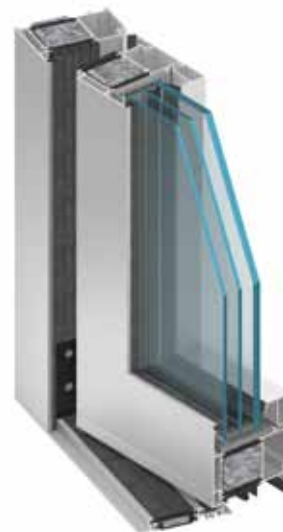
MB-104 Passive SI Door, RC3