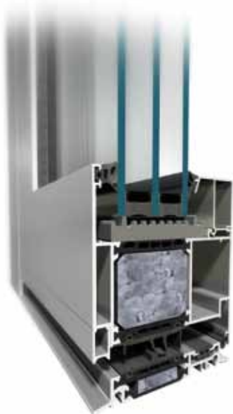
MB-104 Passive SI Door