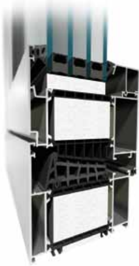
MB-104 Passive Aero