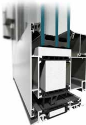
MB-104 Passive Aero Door